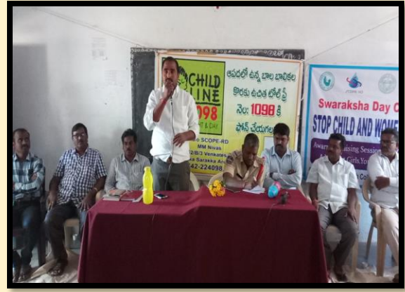
Open house at Gollagudem, 8 th division on 26 th February 2018