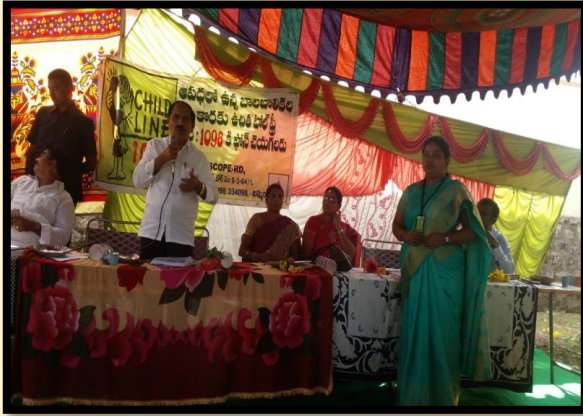
Open house at Sri Ram nagar, 14 th division on 1 st November 2017