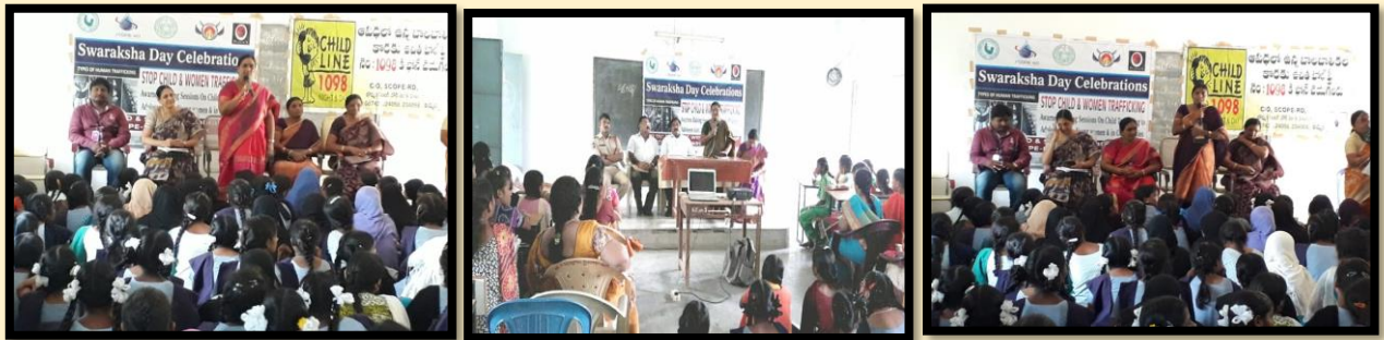
Date: 16/09/2017 Venue: Govt High School, Chunchupally, Badradri, Khammam Swaraksha Day at "Saahithi Junior College, Khammam