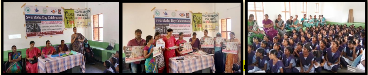
Date: 16/09/2017 Venue: Government Girls High Shool, Khammam