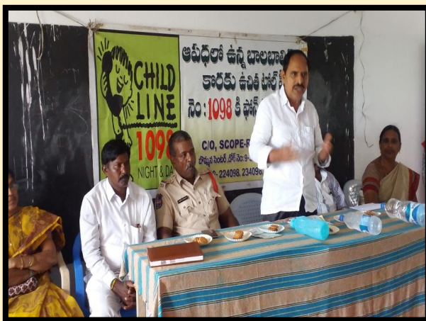
Open house at Kothagudem, 7 th Division on 26 th August 2018