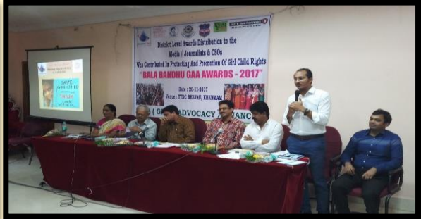
Guests sharing the experience about the program