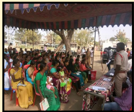
Open house at panduranga Puram on 19 th January 2018